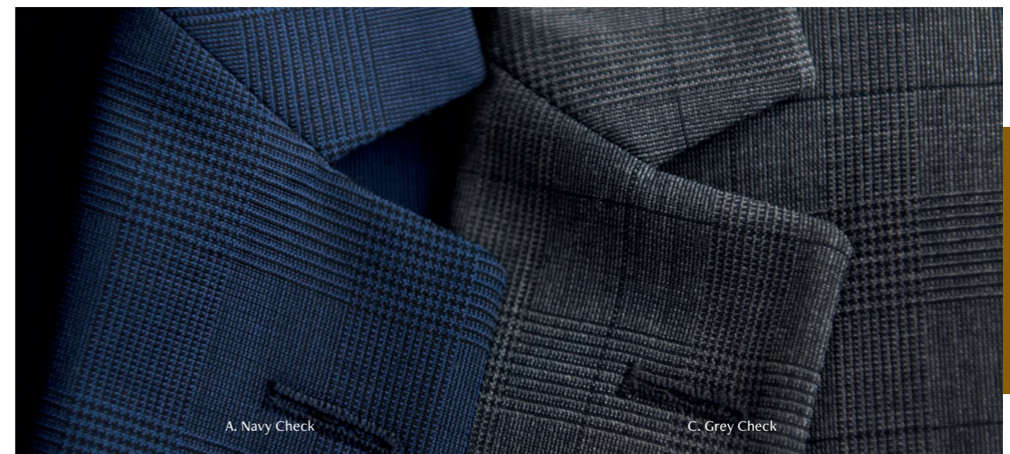
A. Navy Check