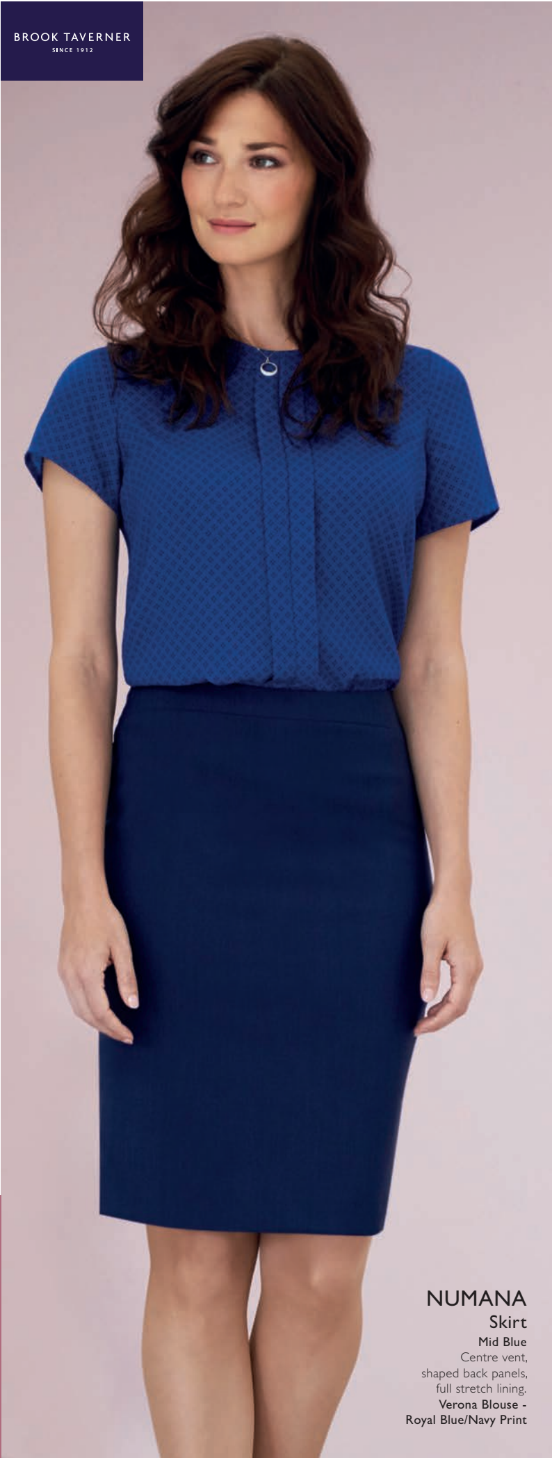
NUMANA Skirt Mid Blue Centre vent, shaped back panels, full stretch lining. Verona Blouse - Royal Blue/Navy Print