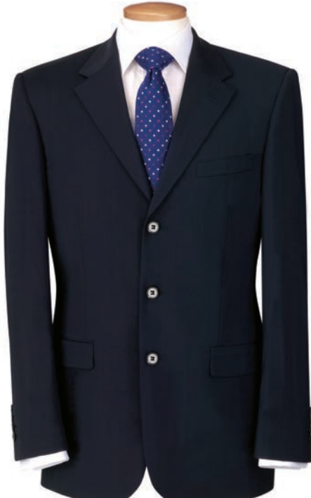
Centre back length at size 40R = 78cm