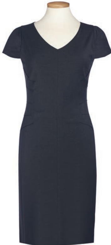
Centre back length at size 12R = 97cm

Codes & Colours: 2286A Navy 2286C Charcoal 2286D Black 2286G Light Grey 2286H Mid Blue