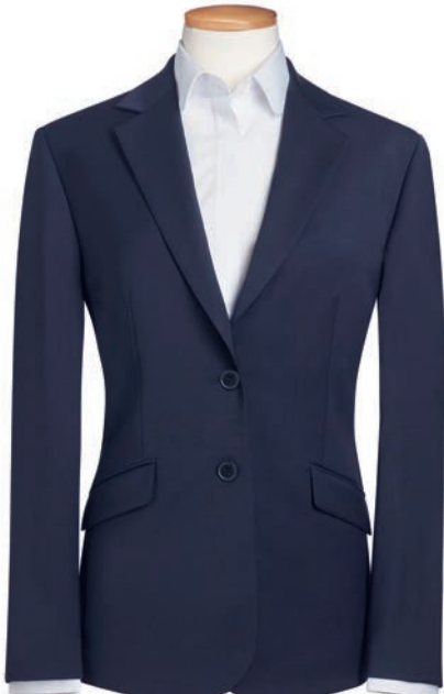
Centre back length at size 12R = 63cm

Codes & Colours: 2250A Navy 2250C Charcoal 2250D Black 2250G Light Grey