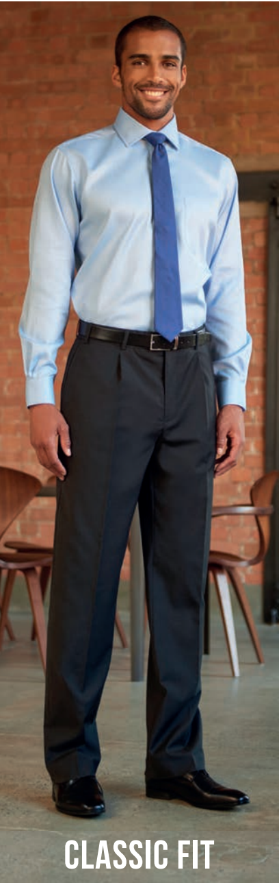
IMOLA Classic Fit Trouser Charcoal Single pleat. Altare Shirt - Blue Herringbone