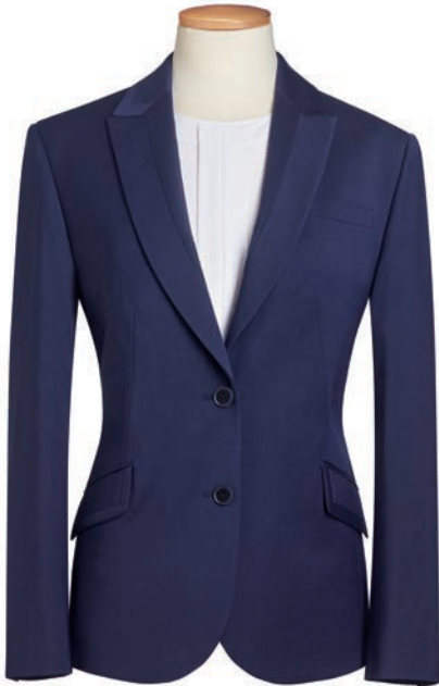
Centre back length at size 12R = 63cm

Codes & Colours: 2222A Navy 2222B Navy 2222C Pinstripe 2222D Charcoal 2222D Black 2222F Charcoal 2222F Pinstripe 2222G Light Grey 2222H Mid Blue