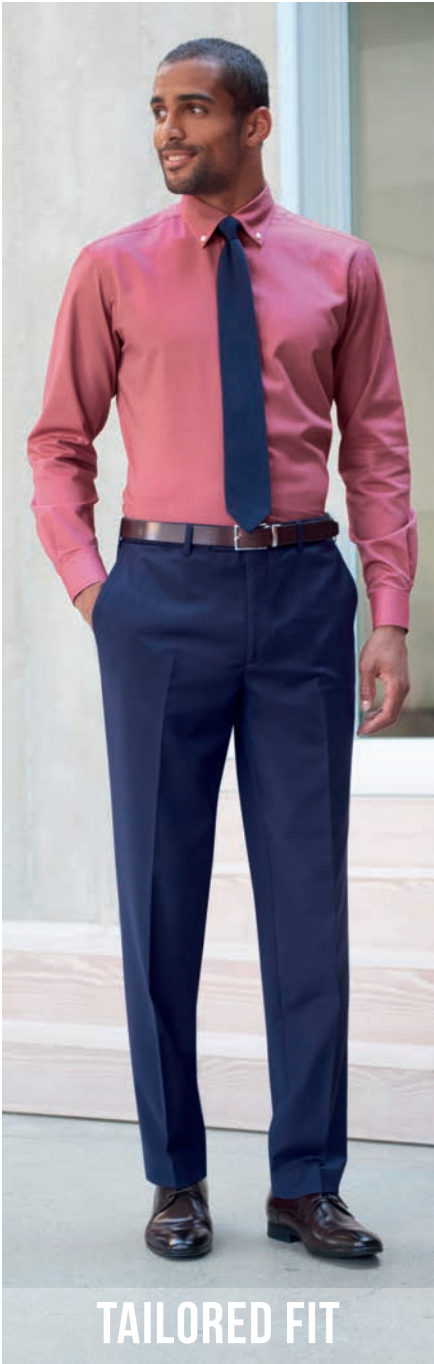
AVALINO Tailored Fit Trouser Mid Blue Flat front trouser. Toronto Shirt - Red