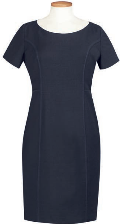
Centre back length at size 12R = 97cm

Codes & Colours: 2289A Navy 2289C Charcoal 2289D Black 2289G Light Grey 2289H Mid Blue