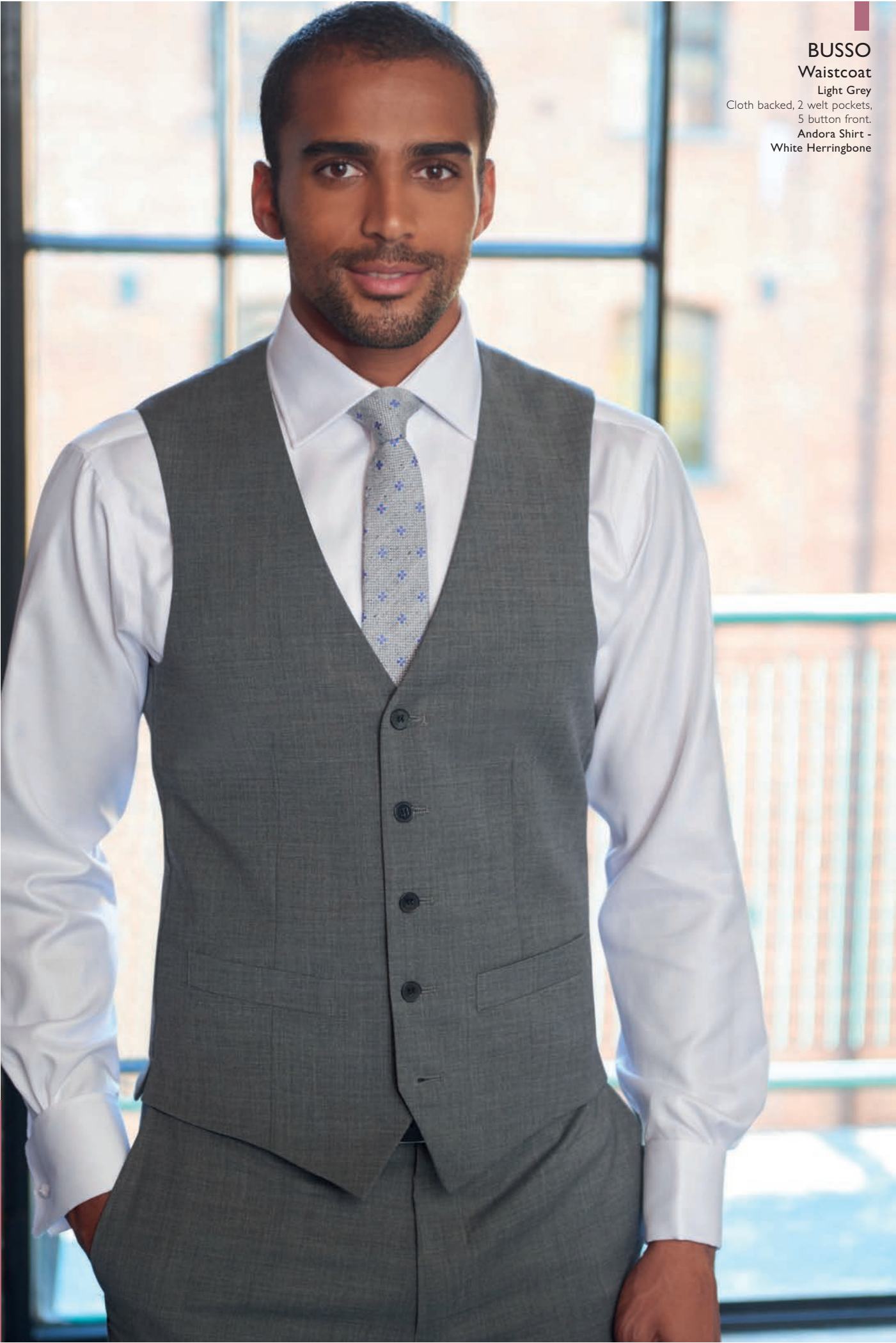
BUSO Waistcoat Light Grey Cloth backed, 2 welt pockets, 5 button front. Andora Shirt - White Herringbone