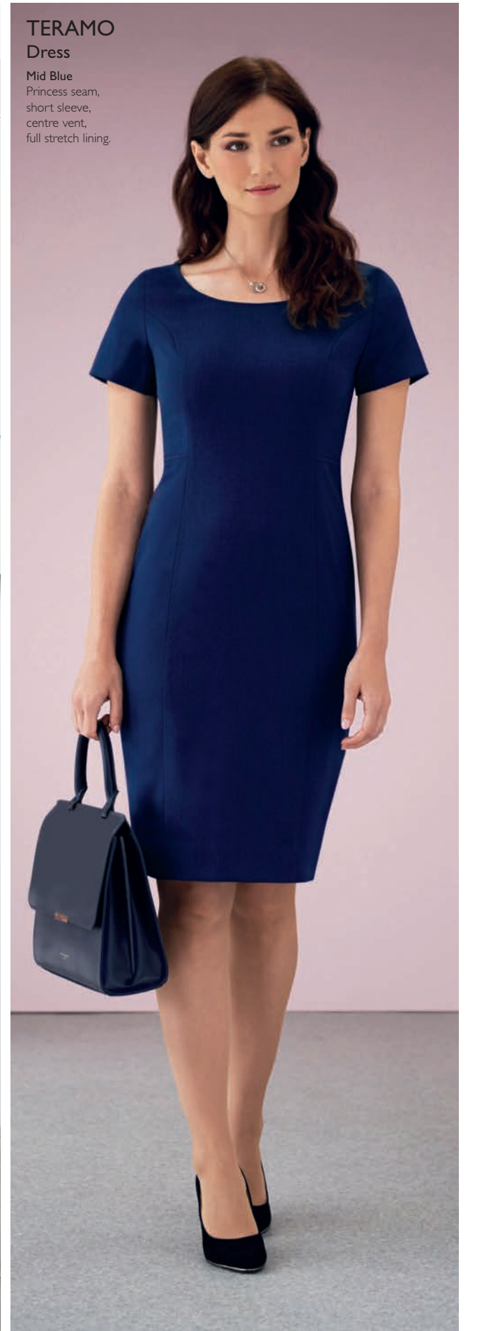
TERAMO Dress Mid Blue Princess seam, short sleeve, centre vent, full stretch lining.