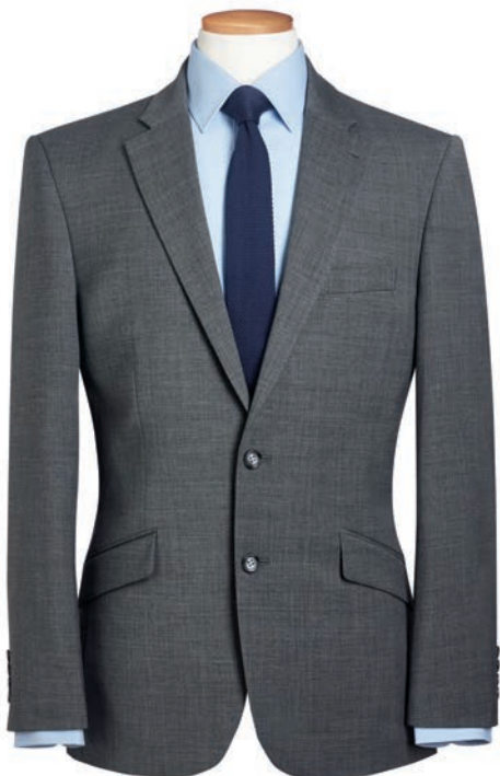
Centre back length at size 40R = 77cm

Sizes 34R to 56R available in solid colours only. Other colours available in sizes 36R to 52R. Sizes 34L and 36L available in colour A only.