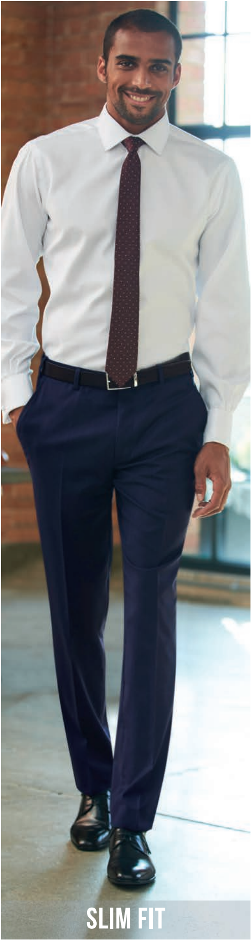
CASSINO Slim Fit Trouser Navy Flat front trouser. Prato Shirt - White Herringbone