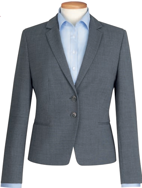
Centre back length at size 12R = 55.5cm

Codes & Colours: 2252A Navy 2252C Charcoal 2252D Black 2252G Light Grey 2252H Mid Blue