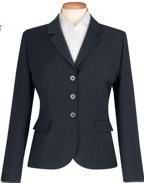
Centre back length at size 12R = 60.5cm