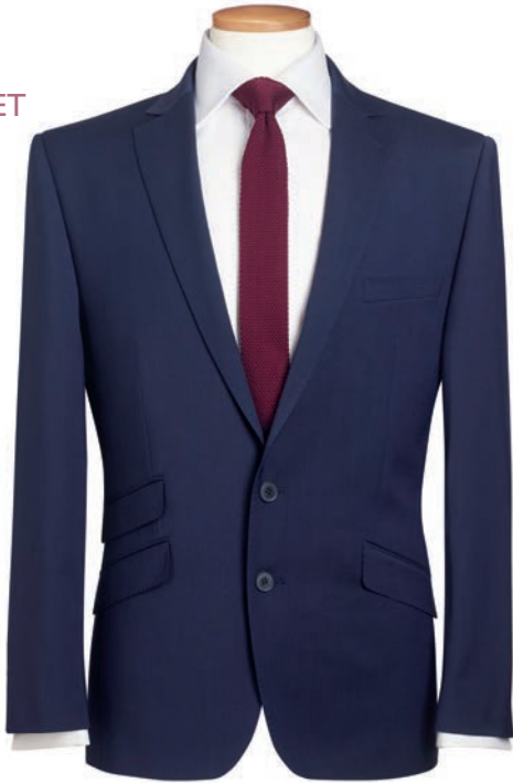
Centre back length at size 40R = 75cm

Codes & Colours: 5985A Navy 5985C Charcoal 5985D Black 5985G Light Grey 5985H Mid Blue